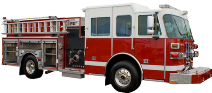
A firefighter engine